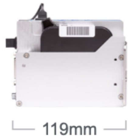
HP PRINTHEAD SIDE ELEVATION