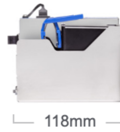
LX PRINTHEAD SIDE ELEVATION