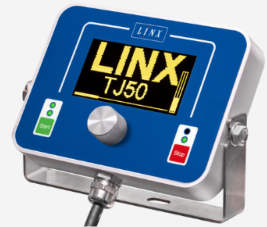
Optional HMI interface

*Operating temperature and humidity range are ink cartridge type dependent